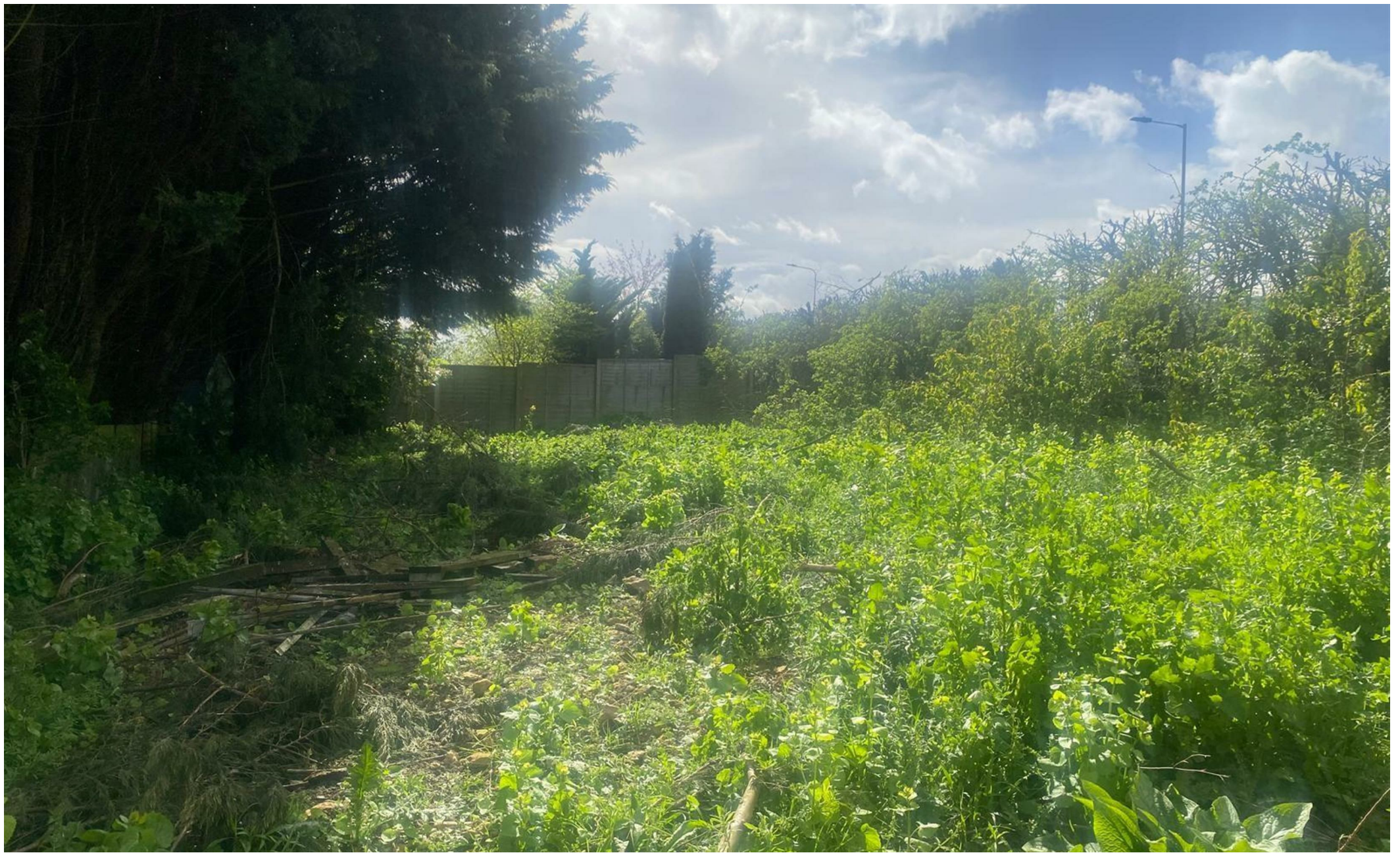
Plot of Land, Scarborough Road, Crossgates, Scarborough, YO12 4JL Price Guide £40,000